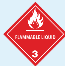
Ignitable Liquid Department of Transportation (DOT) warning label or placard