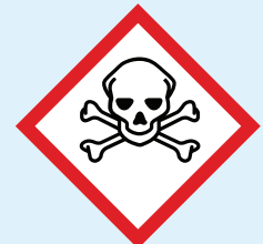
Toxic Substance Occupational Safety and Health Administration pictogram